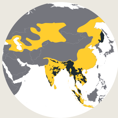
● CURRENT Tiger Range ● HISTORIC Tiger Range