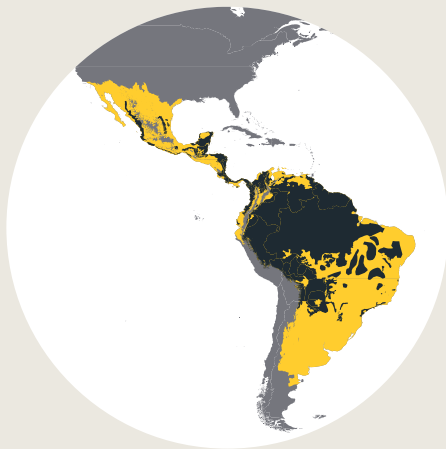
● CURRENT Jaguar Range ● HISTORIC Jaguar Range

Although jaguar populations are found throughout Latin America, this wild cat — the largest in the Western hemisphere — is threatened by illegal hunting, deforestation, human-cat conflict, and loss of wild prey.